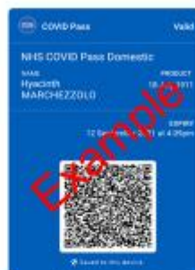
Google Wallet Download