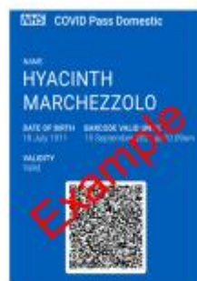
Apple Wallet Download