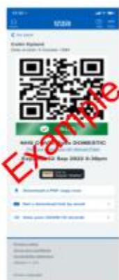
Open on Screen